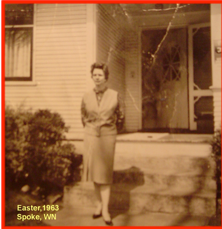
Easter, 1963 Spoke, WN